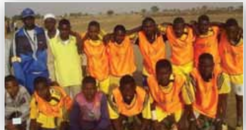
One of the youth football teams at the final rally