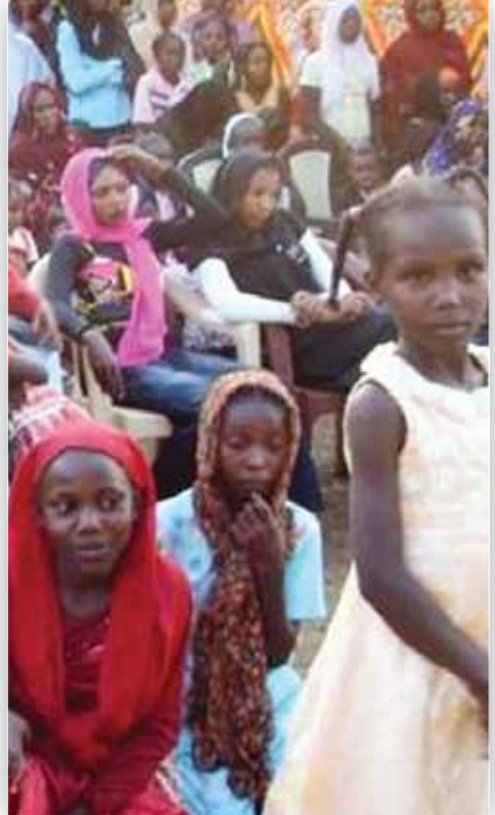
Attendees at the cultural event at Eltdamon club, Muglad