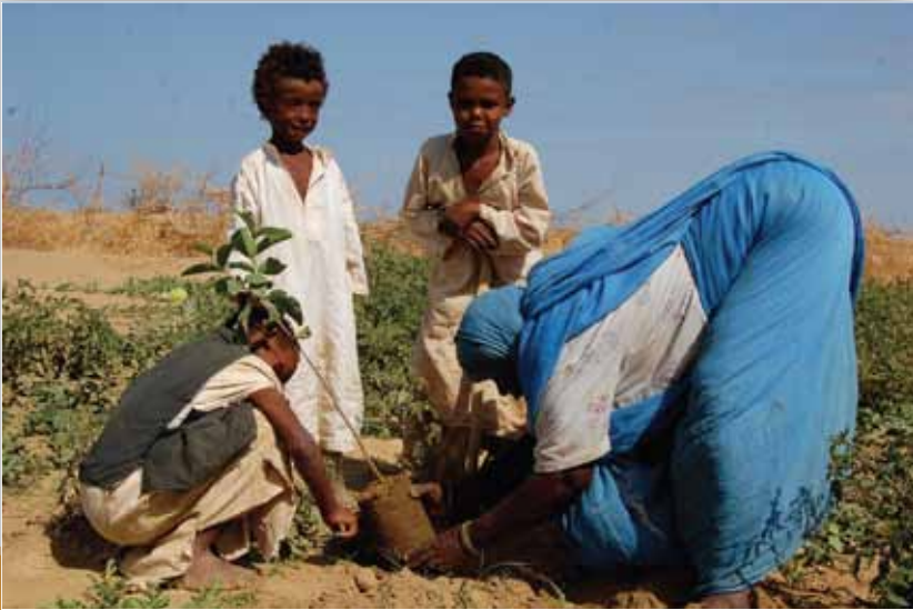
Beja family planting new crops