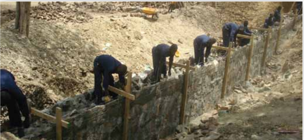
Tourlake sand dams under construction

holding capacity of the sandy river bed. In 2010 the local community in Tourlake, South Kordofan worked with training, tools and technical guidance from SOS Sahel staff and Kenyan sand dam expert, Tullu Ibrae, to construct a new set of sand dams. By training local people, some of whom are ex-combatants from Sudan's civil war, to construct and maintain the dams themselves we are ensuring the sustainability of this infrastructure and enabling communities to fully manage the sand dams themselves in the future.